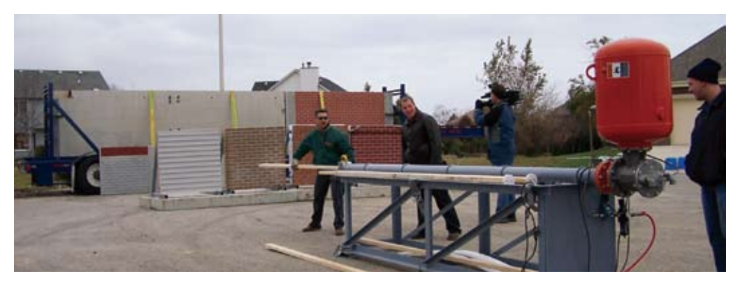
The actual cannon used. Spectators even got to touch the 2 x 4 to confirm the authenticity. In the distance are the panels ready to be tested with the safety wall behind.

Precast concrete homes provide significantly more protection from wind-borne debris than other building materials, according to tests conducted by the Portland Cement Association. The group tested various walls with the impact of a 2x4 wood stud traveling at 100 mph, the equivalent of wind-borne debris during a tornado with 250-mph winds. About 90% of tornados have wind speeds of less 150 mph, the group says. Of all materials tested, only the concrete design stopped the debris from penetrating the wall. All others suffered penetration.