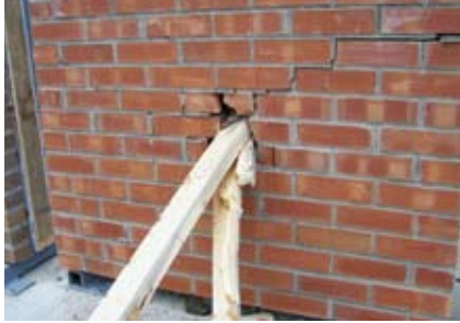
Test three smashed a 2 x 4 through a brick home with steel framing. This damage is still rather significant, but in this test the projectile did not travel through the wall. Looking at the back side shows it would take only slightly more force to push all the way through.